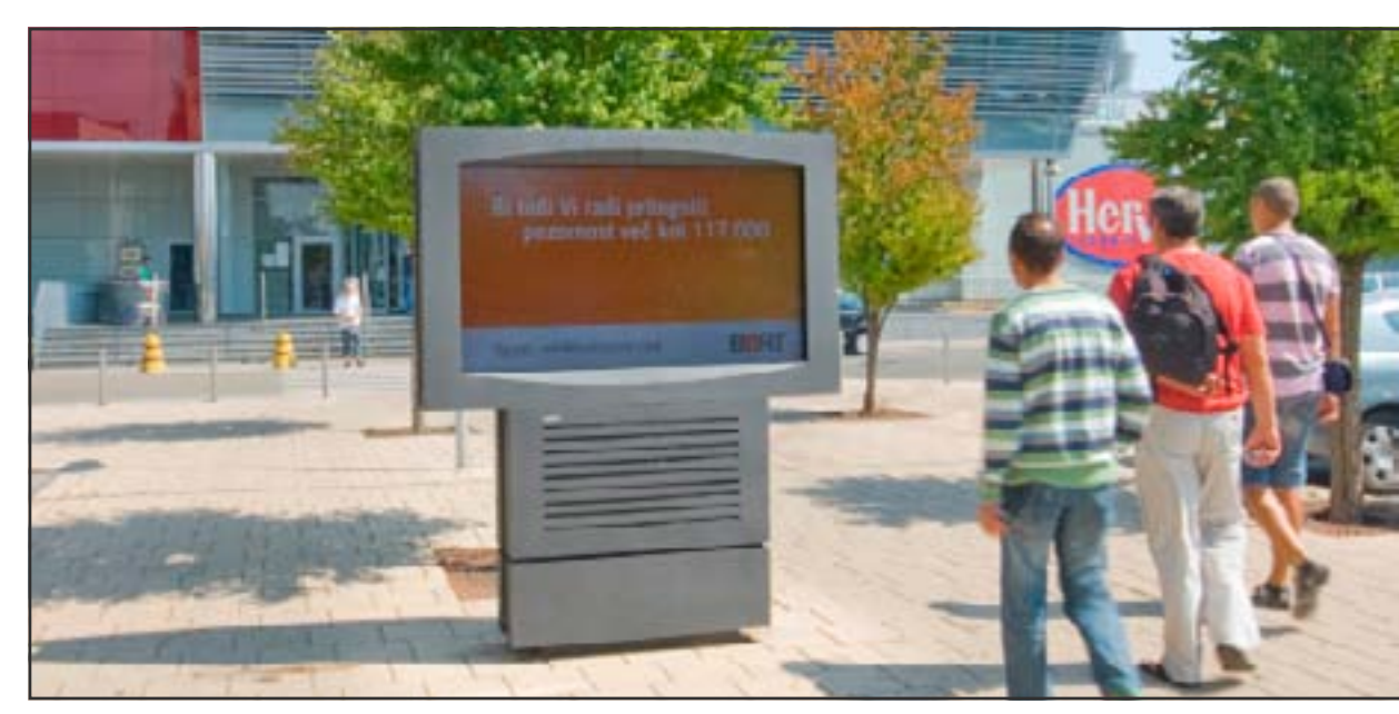
imotion 65" Landscape 3rd generation, October 2007 Installation at BTC shopping mall (Slovenia)

imotion° is Full HD LCD technology based all weather urban furniture display platform, designed to deliver high quality digital contents and raise the effectiveness level of communication to the target audience in any outdoor environment.