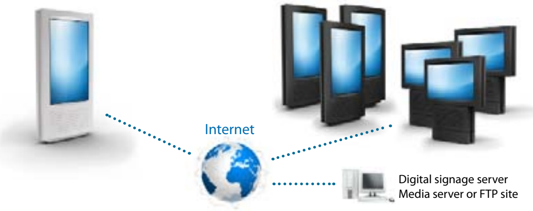
imotion° products can function as individual units as well as elements within bigger networks

Some of the locations imotion can deliver value: city walkways, office buildings, university campuses, entrances to stores, financial institutions, amusement parks, ZOO, mass transit stations, ski resorts, gas stations, shopping centers, casinos, golf courses, health resorts, recreation grounds, state frontiers, cruising ships, etc.