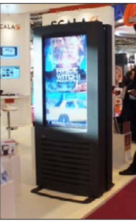
Sun exposed on 52" portrait double side

imotion* excels in heat management and is immune to effects of humidity and dust