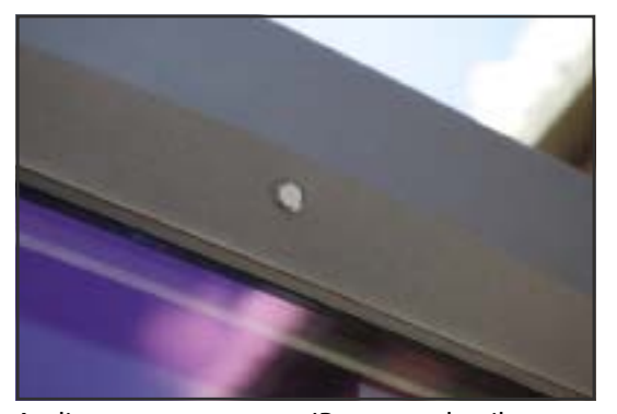
Audience measurement IP camera detail