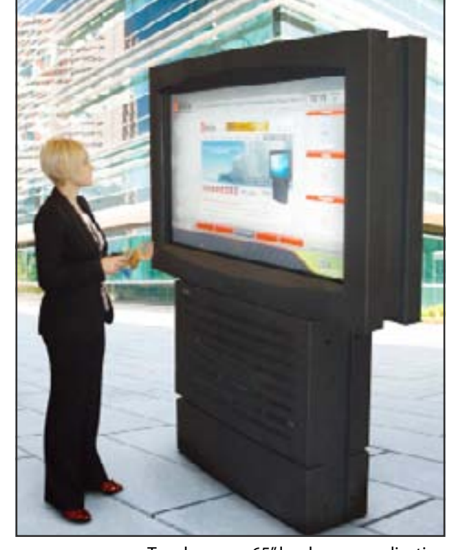
Touch screen 65" landscape application