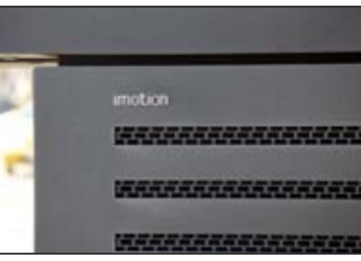
Front Landscape mask with imotion logo