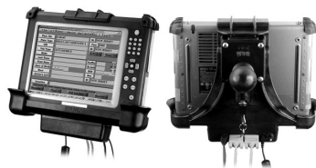
Vehicle Dock Enclosure