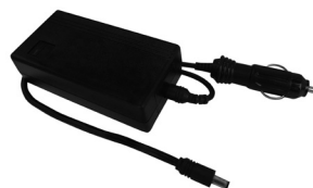
Car Adapter (Supports 12~32VDC or 36-48VDC)