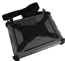
Hand strap & Shoulder Bag