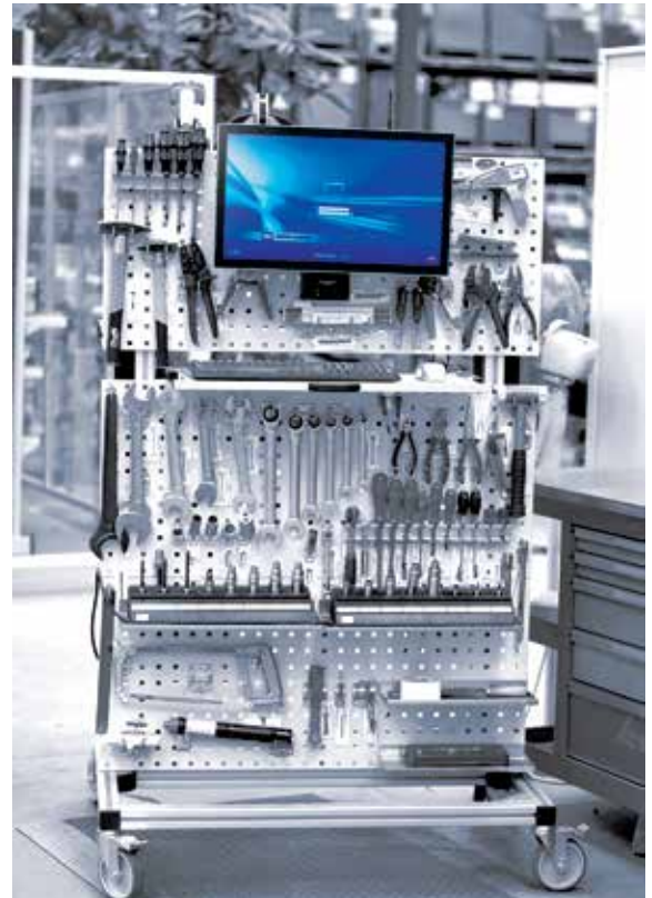
- UTC-520 installed on mobile tool cart

This strategy clearly boosts the assembly production rate because workers who encounter production problems no longer have to seek out the relevant person for assistance; instead, the specialist responsible contacts the worker directly. The system also logs all Andon alarm alerts for future analysis to facilitate further optimization of the production processes.